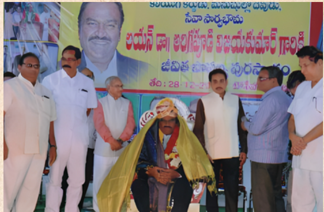
'Lifetime Achievement Award' in recognition for Services rendered to Society by Ketha Ankulu Memorial Trust